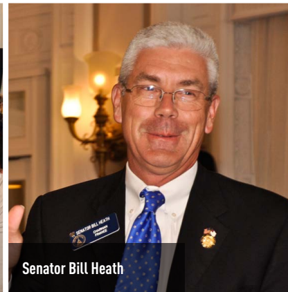
Senator Bill Heath